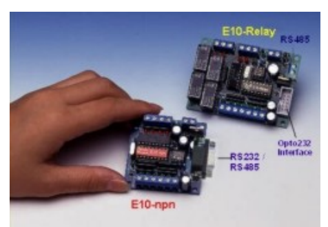
Photograph of E10-npn+ and E10-Relay+

A. Use as stand-alone Tiny Ladder Logic PLC